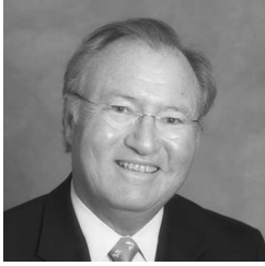
Glenn F. Tilton