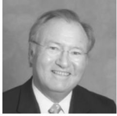
Glenn F. Tilton