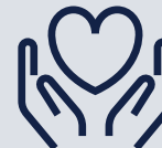
Grants and charitable donations