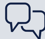
Consulting and speaking engagements